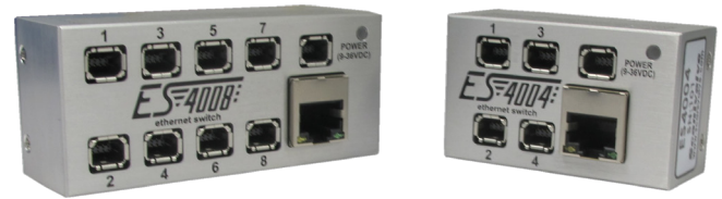
ES4008 and ES4004 Miniature Ethernet switch

The ES4000 is an unmanaged Ethernet switch to support the Scanivalve MPS4264 series of Ethernet pressure scanners. It is designed specifically to be as small as possible to enable it to be installed in wind tunnel models along side MPS4264 scanners. This allows the user to simply bring a single Ethernet cable from the control network or host computer into the test article. This minimizes test setup time and the number of cables that must pass through the critical, high demand space in the sting. The ES4008 is a 9 port switch, providing support for 8 MPS4264 scanners and a single