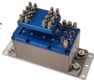
DSA5000 Gas shown with optional “QD” Px Header and Shock Mount Kit

All-Media or liquid builds are designed to handle a wide variety of compatible measurement media including water, oil, fuel, vapor, and more. All-media builds will have unique features including: