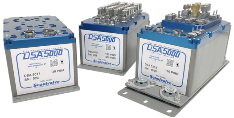
From Left to Right: DSA5000 - Standard Gas, DSA5200 - All-Media, DSA5300 - Gas / iDDS with "QD" Header and Shock-Mount